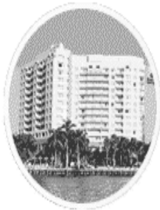
DoubleTree Guest Suites Hotel

This year's Success Summit and Jazz Benefit will be held on November 9 , which will fall on the Veteran's Day holiday weekend. Many of you told us that you wished you had more time to spend escaping the cold of your hometown while visiting with us in Florida, so this year you will have a long weekend to do so — and in a fabulous hotel location!